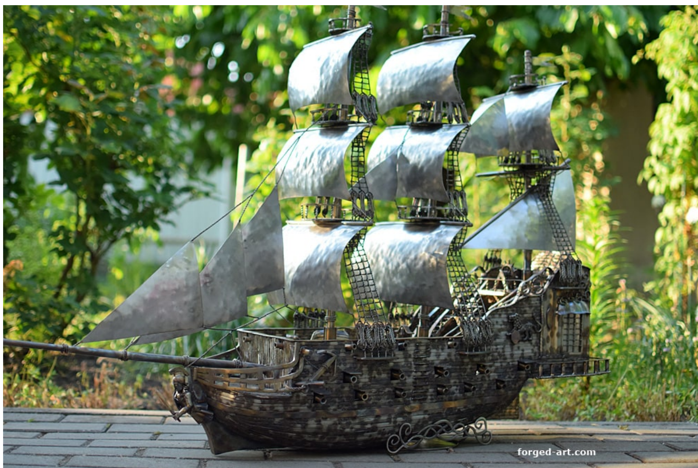
The most beautiful sailing ship model in the world