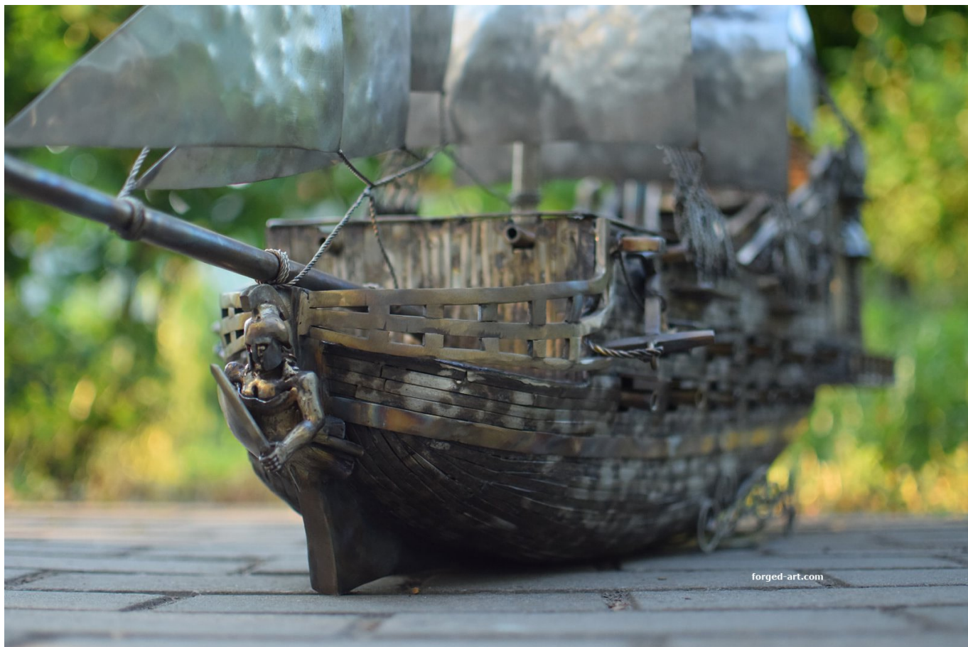
The ship is made of hundreds of hand-processed elements