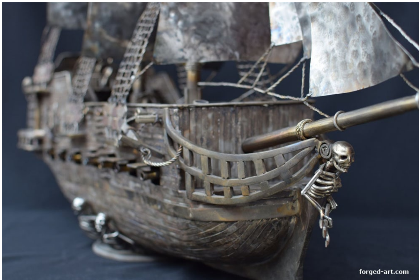
Assassin Creed 4 sailing ship - metal figure