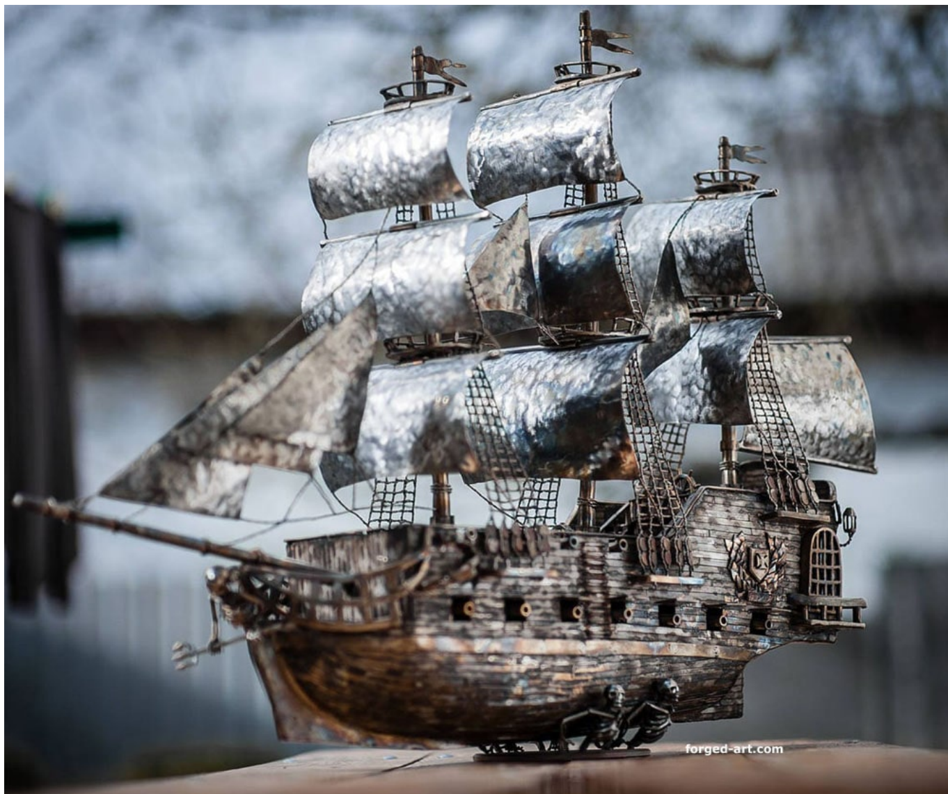
Stainless steel ship