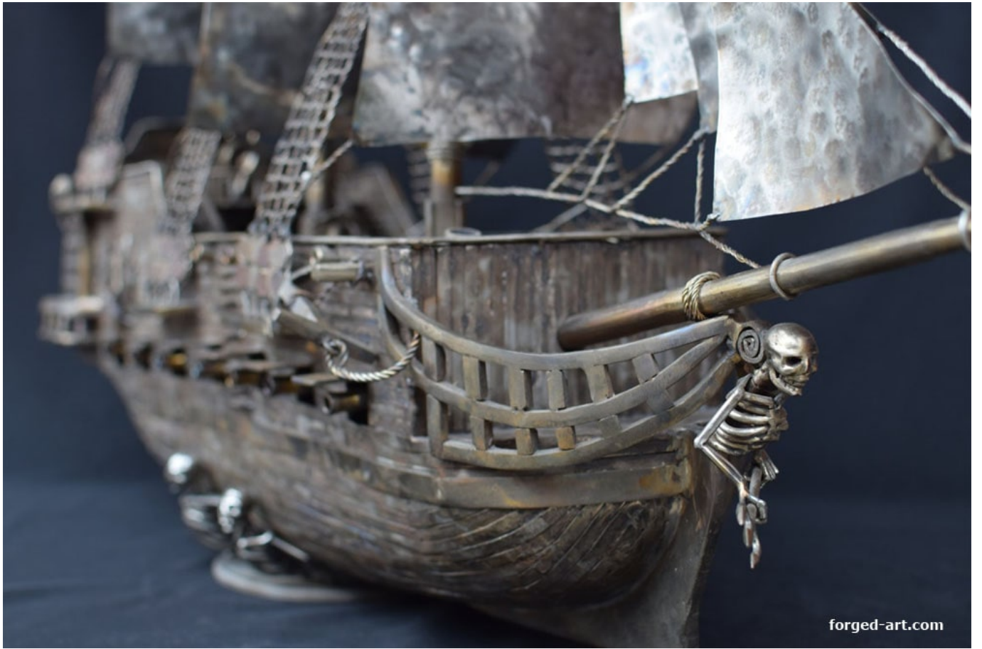
Assassin Creed 4 sailing ship - metal figure