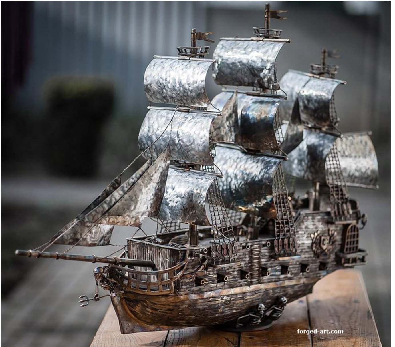
Metal pirate sailing ship