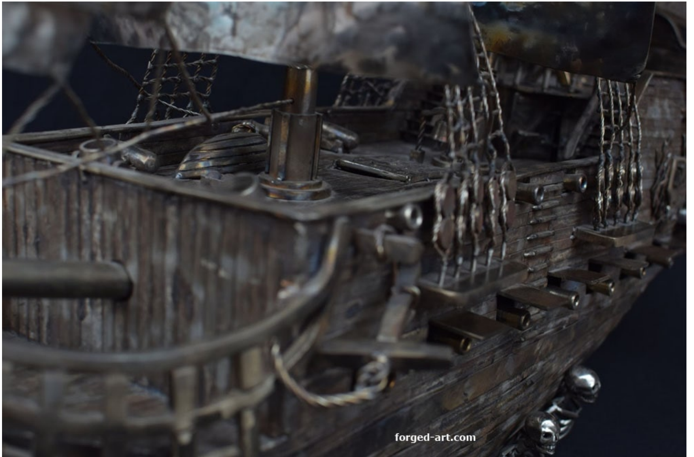
Handmade steel ships