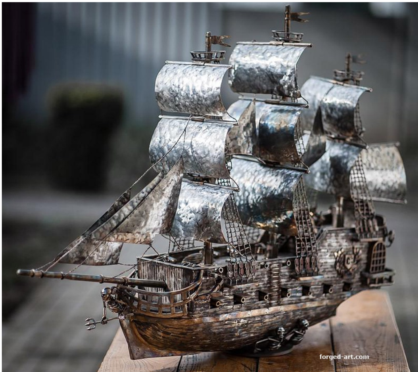
Metal pirate sailing ship