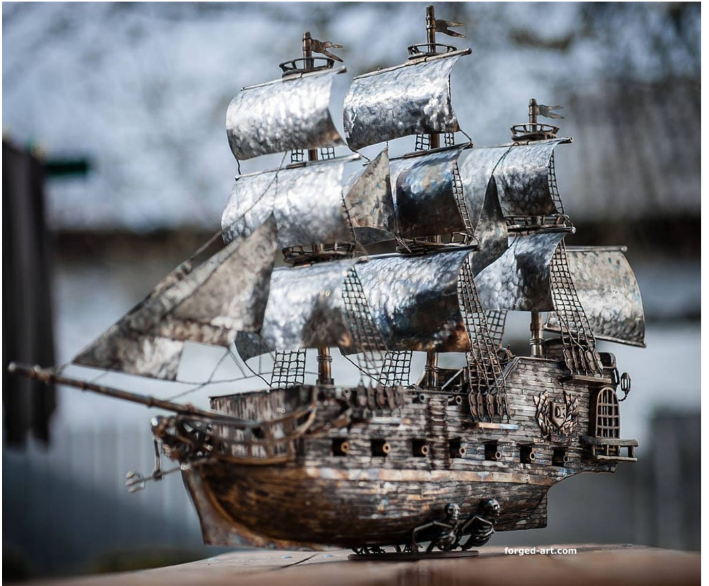
Stainless steel ship