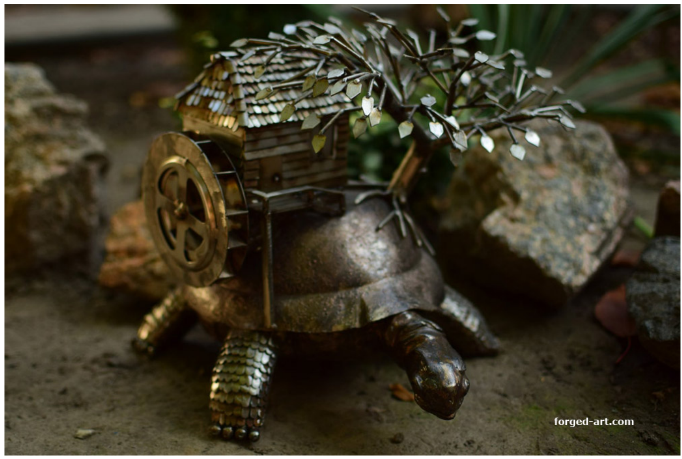
Escape from reality - stainless steel sculpture