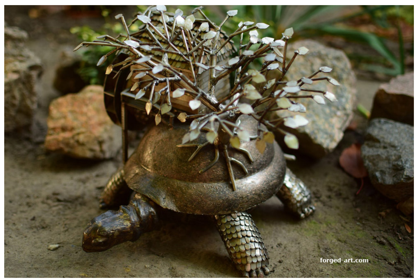
Turtle mill and tree carved out of steel