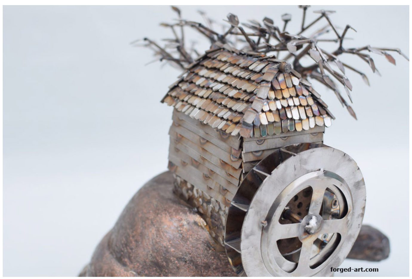
The sculpture will decorate any place