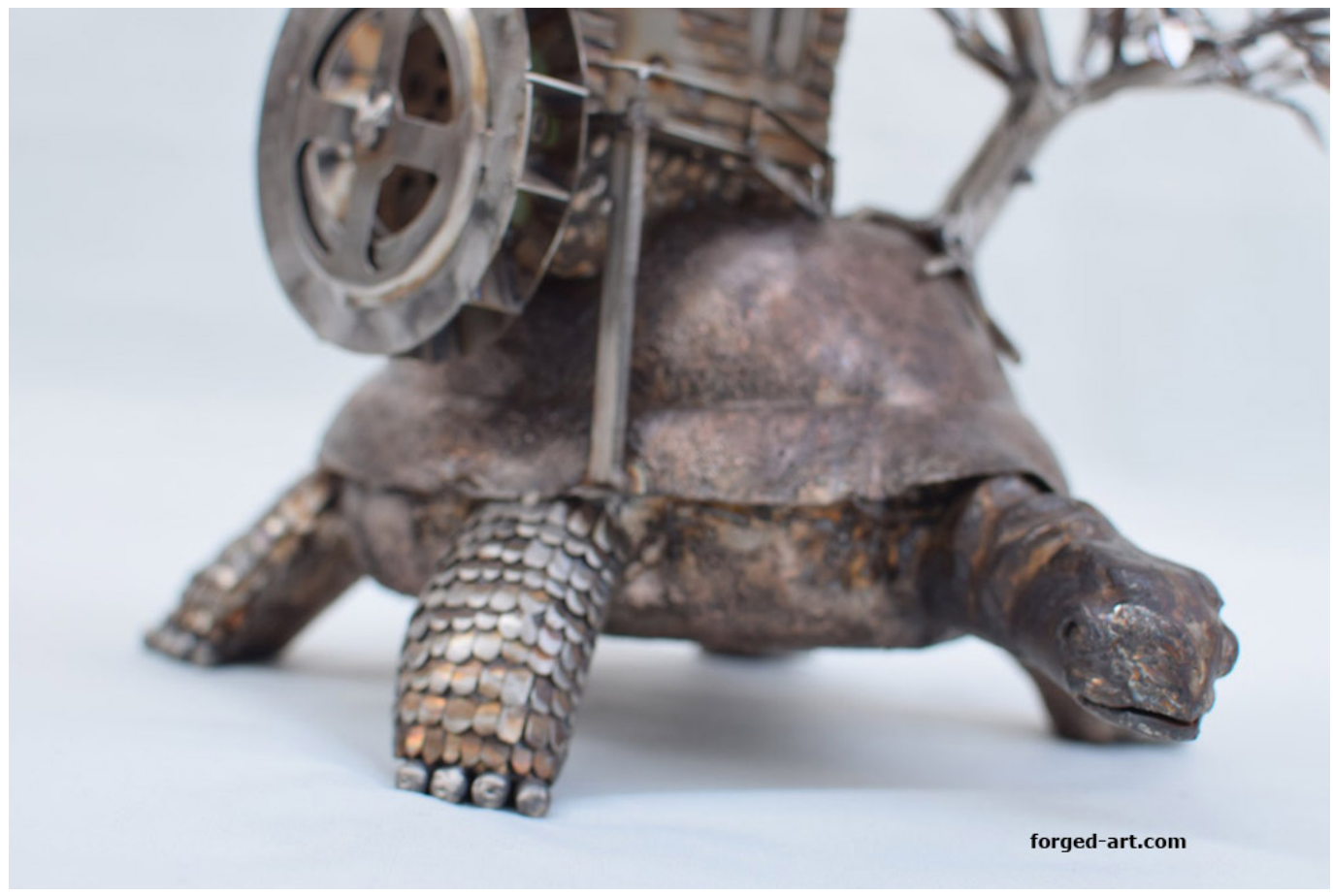
We create the most beautiful steel sculptures in the world