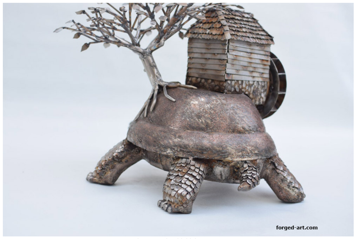
sculpture made with high accuracy