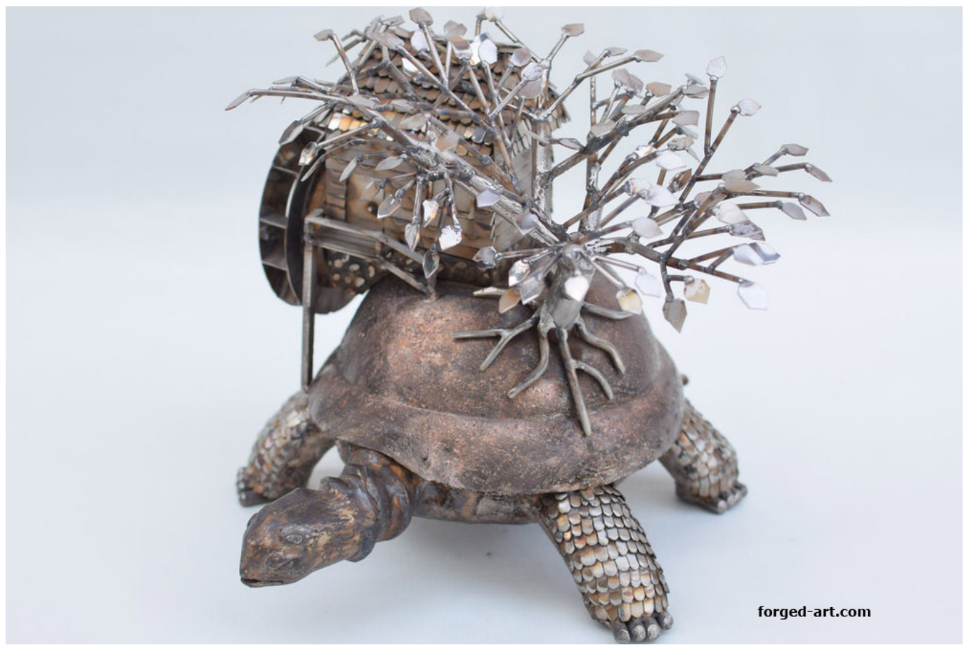
the upper part of the sculpture is covered with natural copper