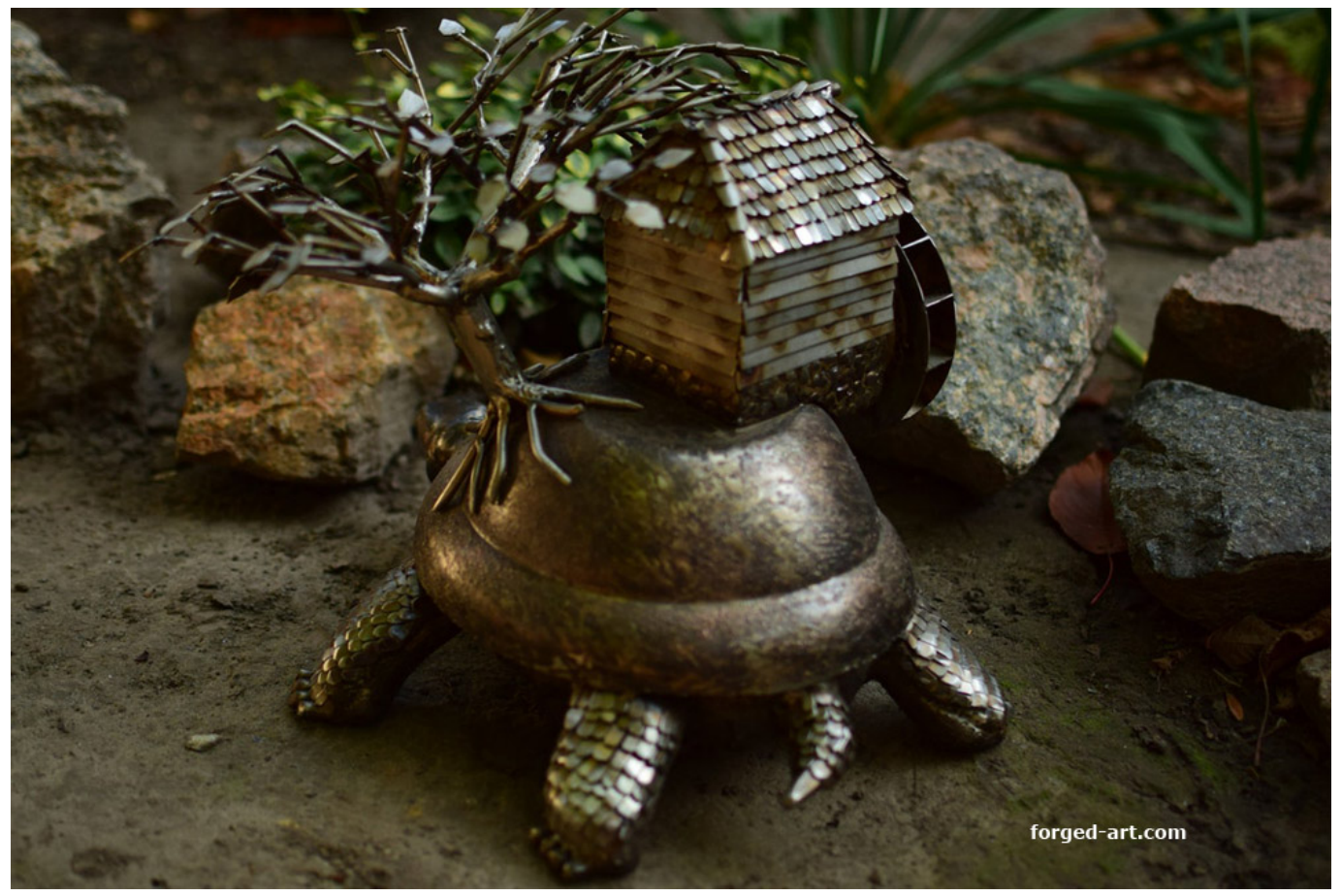
Abstract stainless steel figure