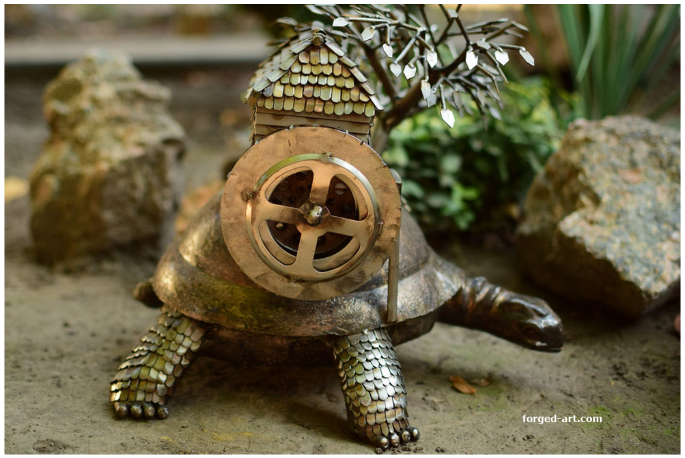
100% handmade - piece of art