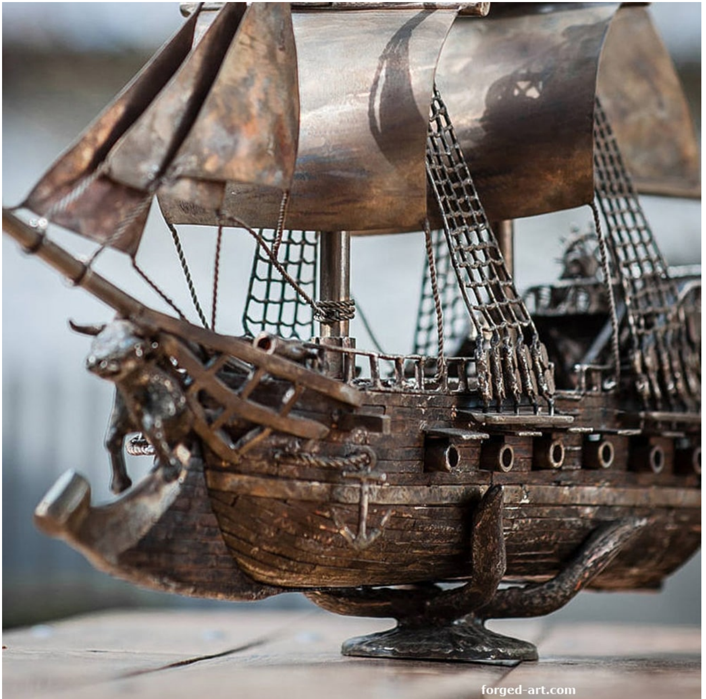
pirate ship model