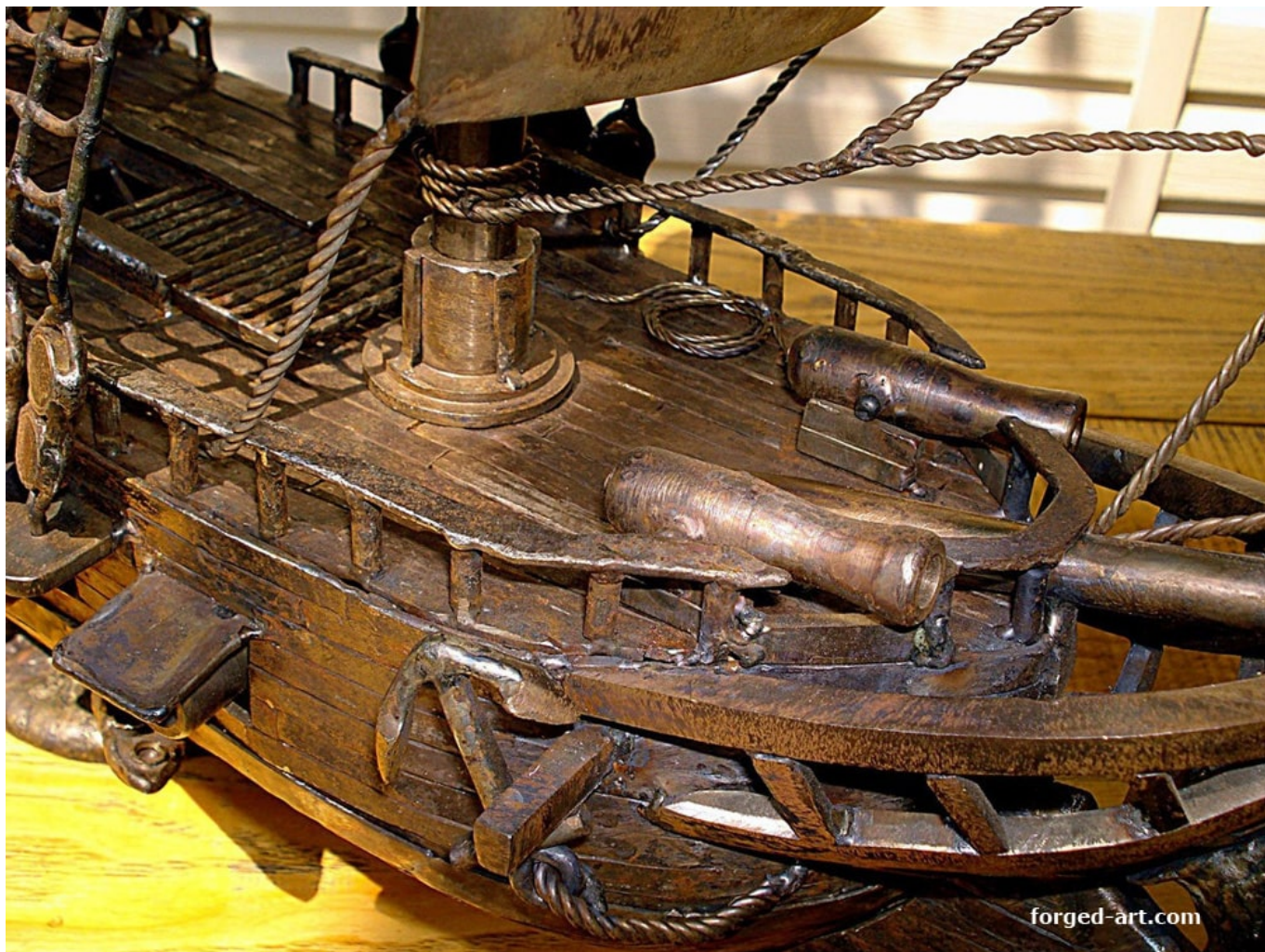
Many things on the ship are movable