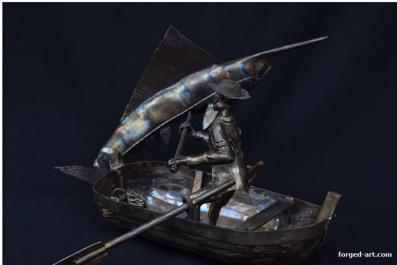
Handmade metal fisherman