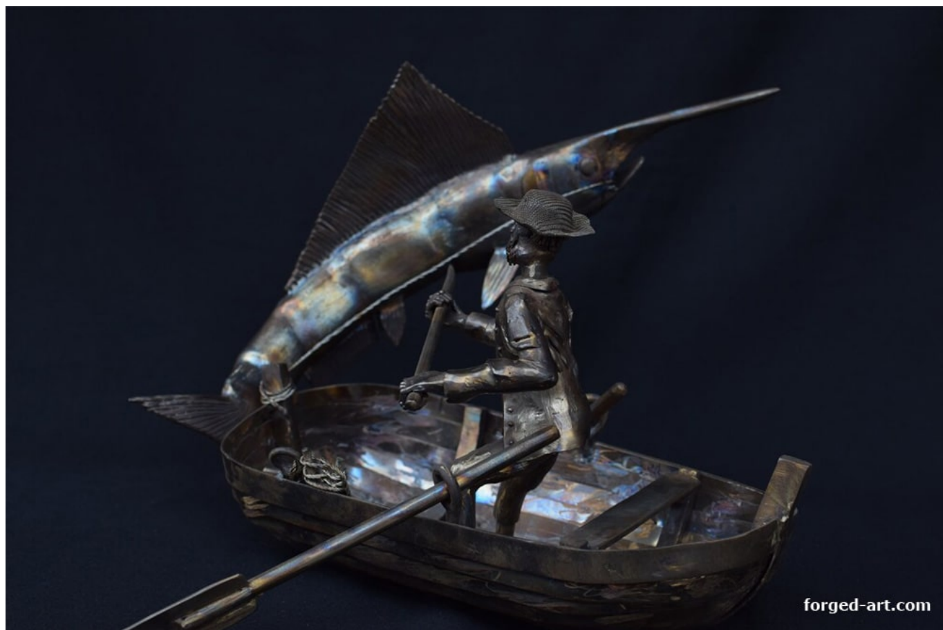
Handmade metal fisherman

sculpture is taken from the works of Ernest Hemingway