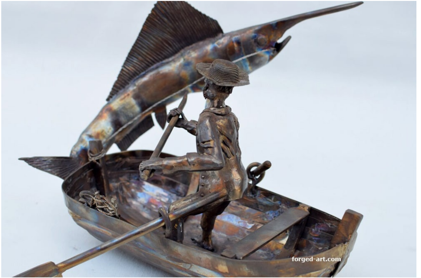
Sculpture from the work of Ernest Hemingway