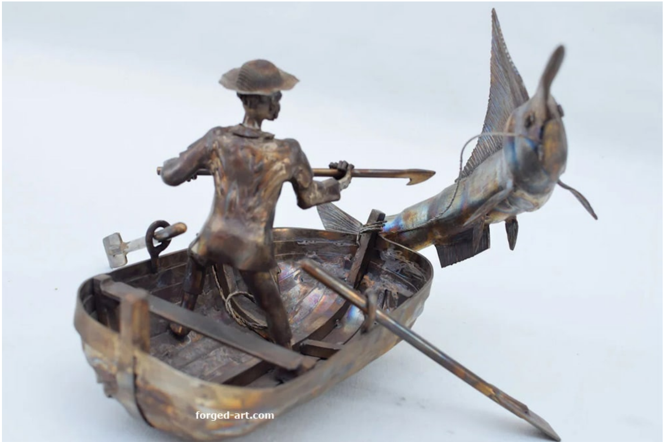
The old Man and the Sea figure