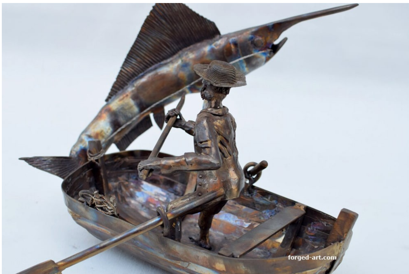
Sculpture from the work of Ernest Hemingway