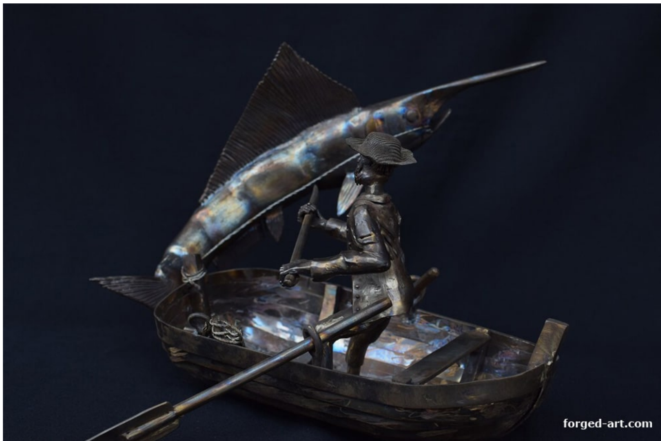
Handmade metal fisherman