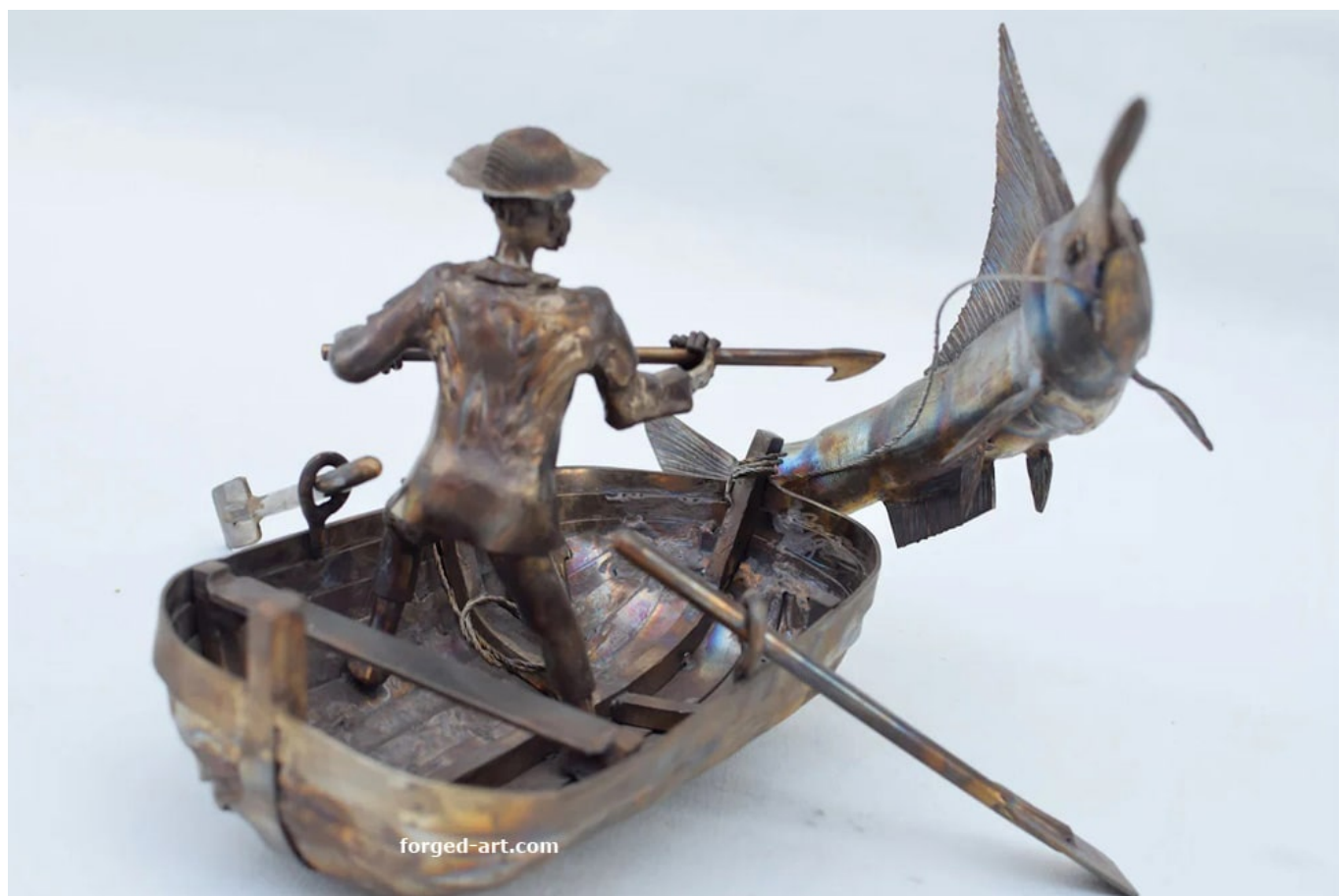
The old Man and the Sea figure