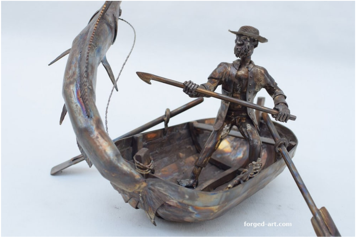
The fisherman on the boat - stainless steel sculpture