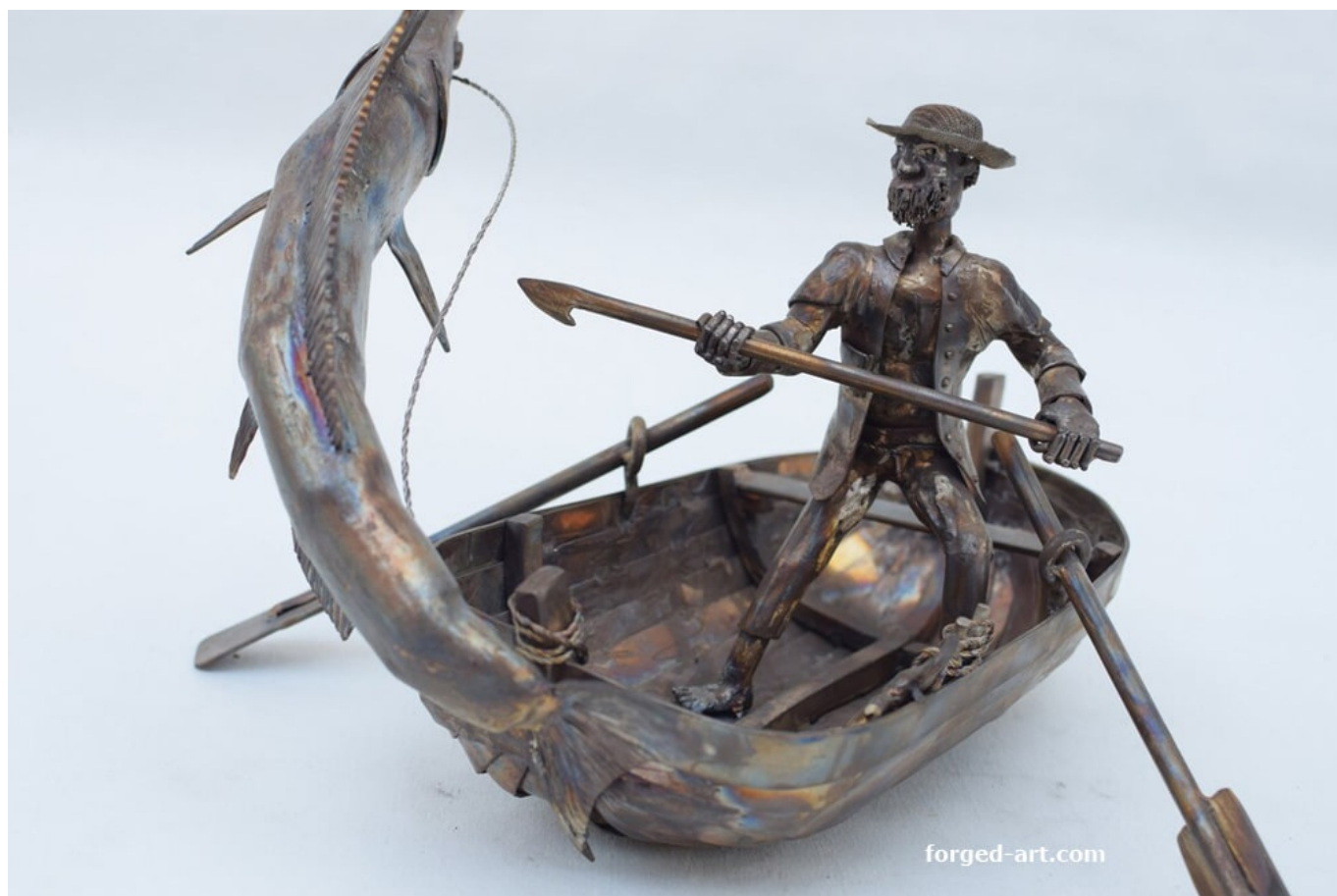
The fisherman on the boat - stainless steel sculpture