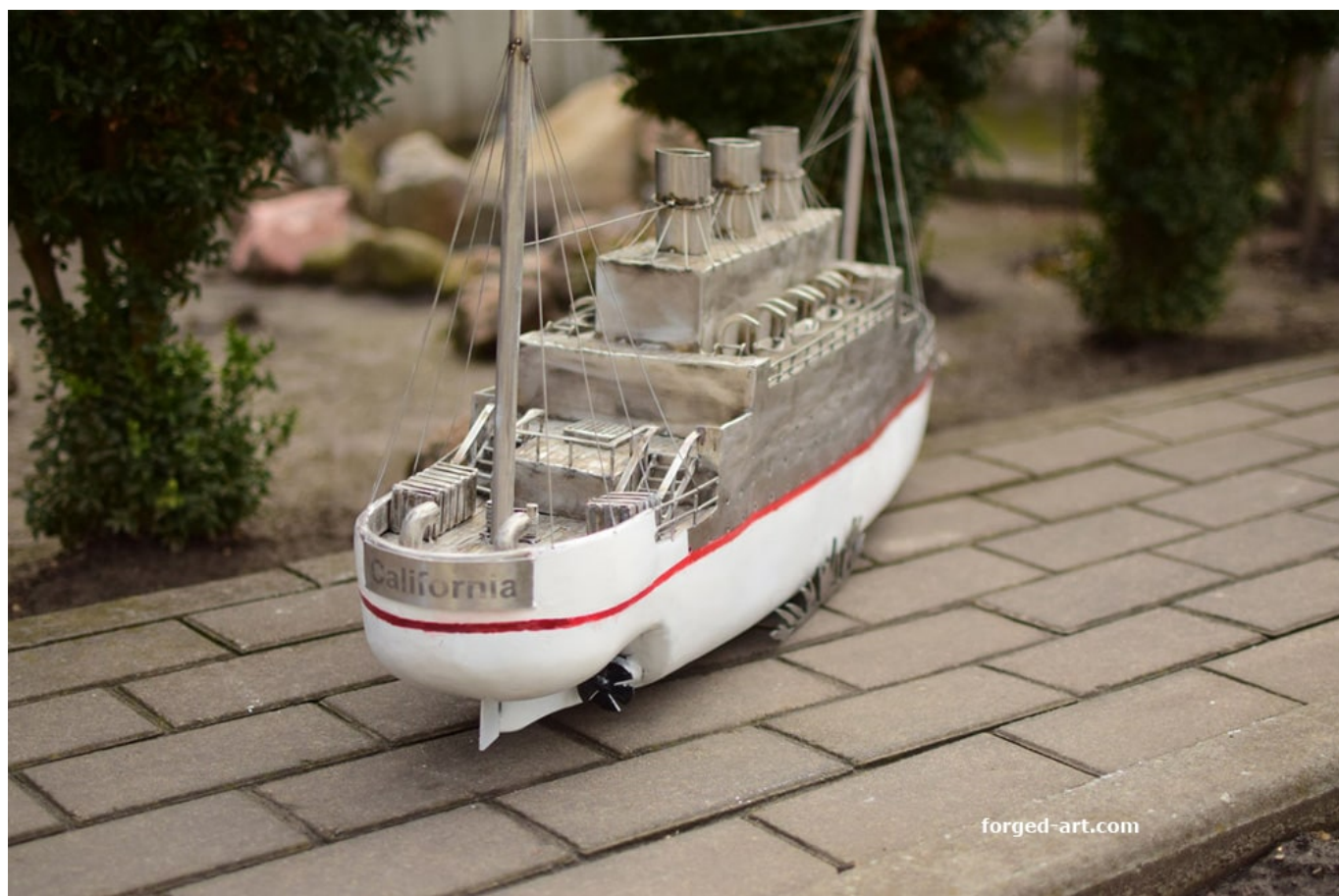
The model is made entirely of stainless steel