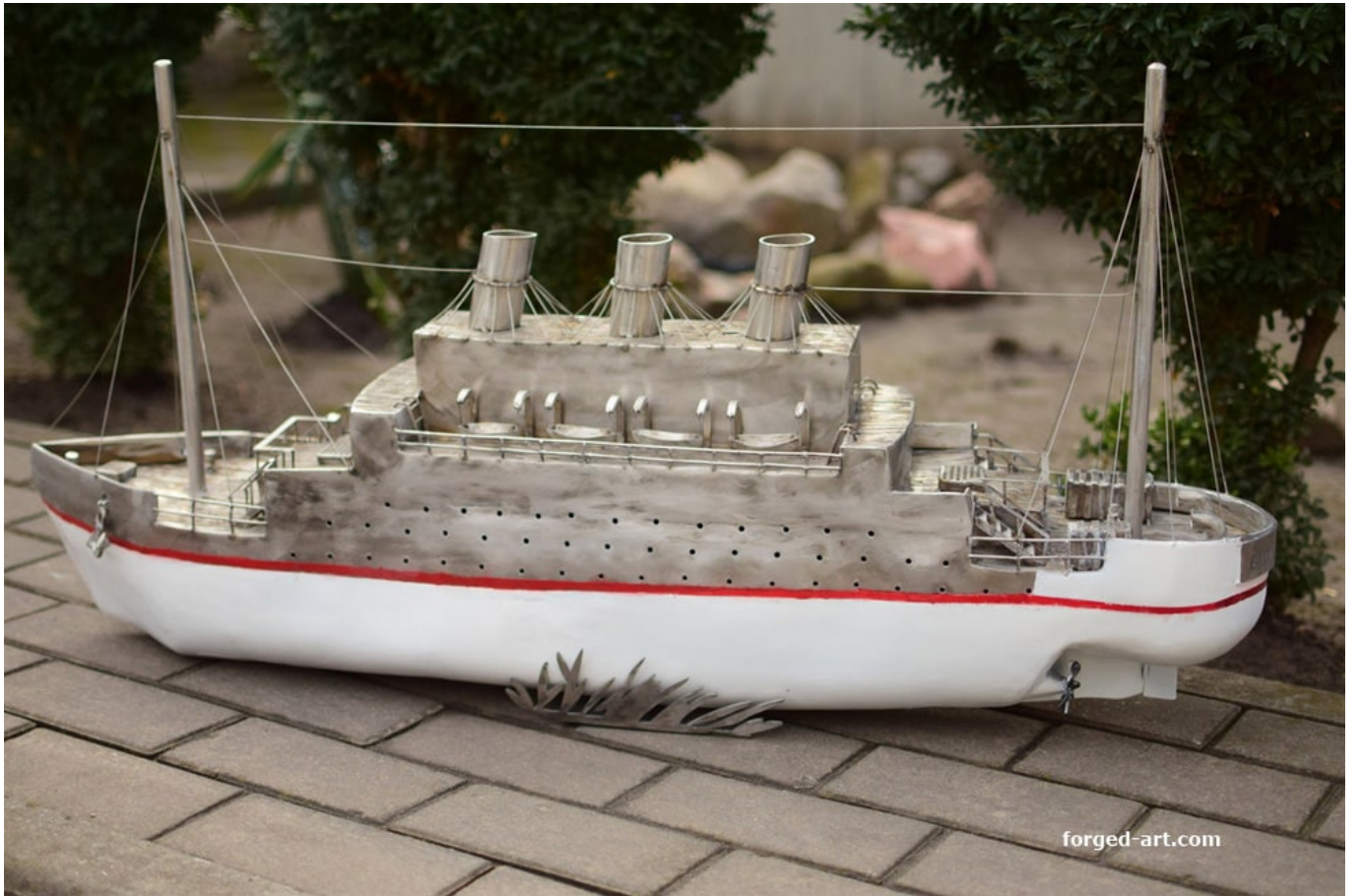
The model is very large and carefully made