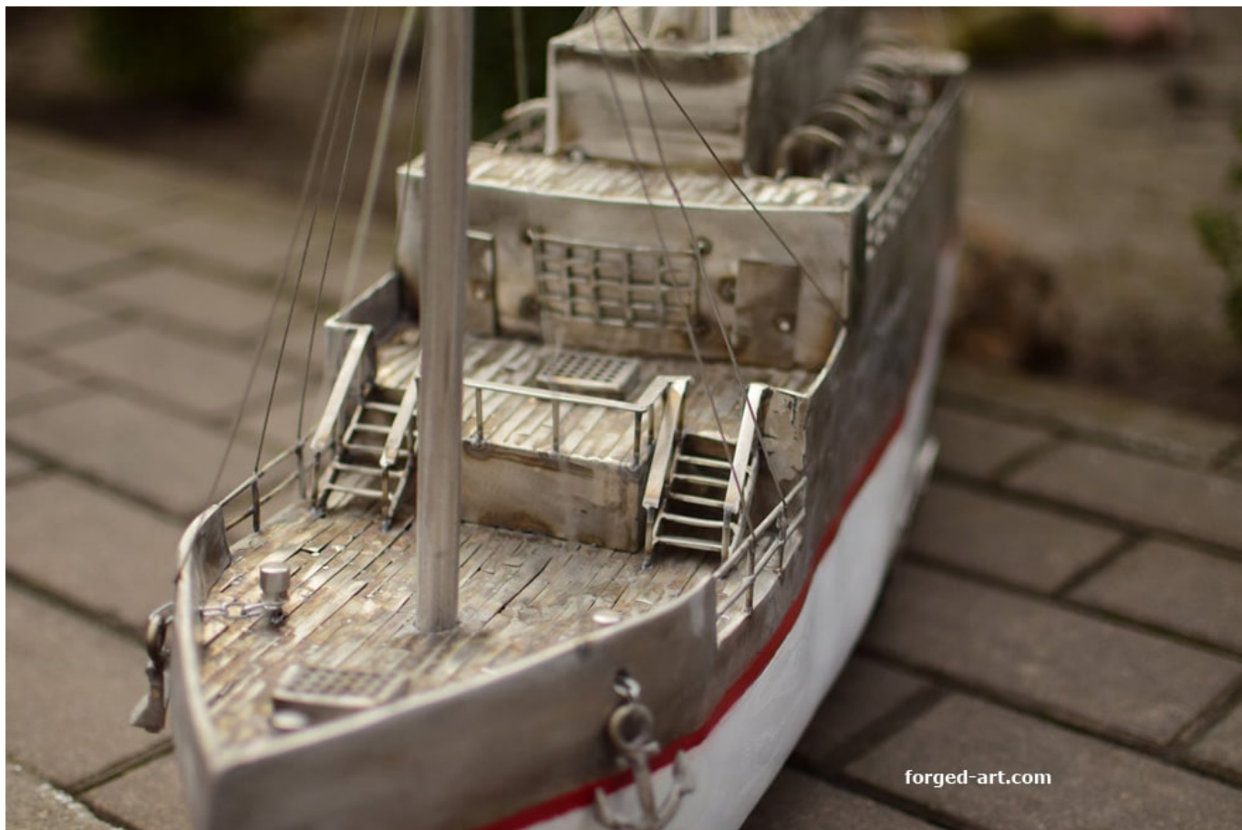
The deck of the ship is made of hundreds of hand-made elements