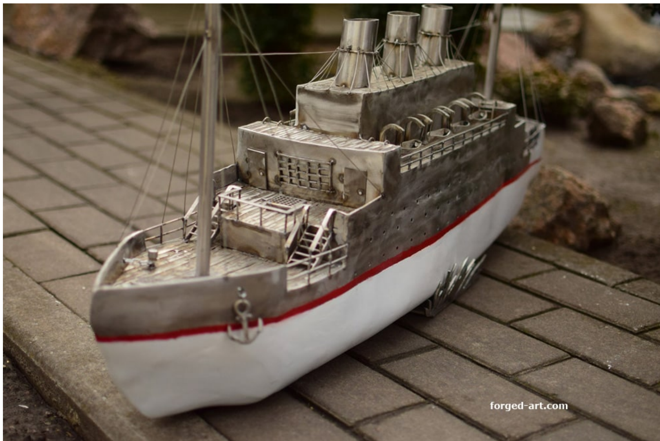
California - a handcrafted model of a steamer