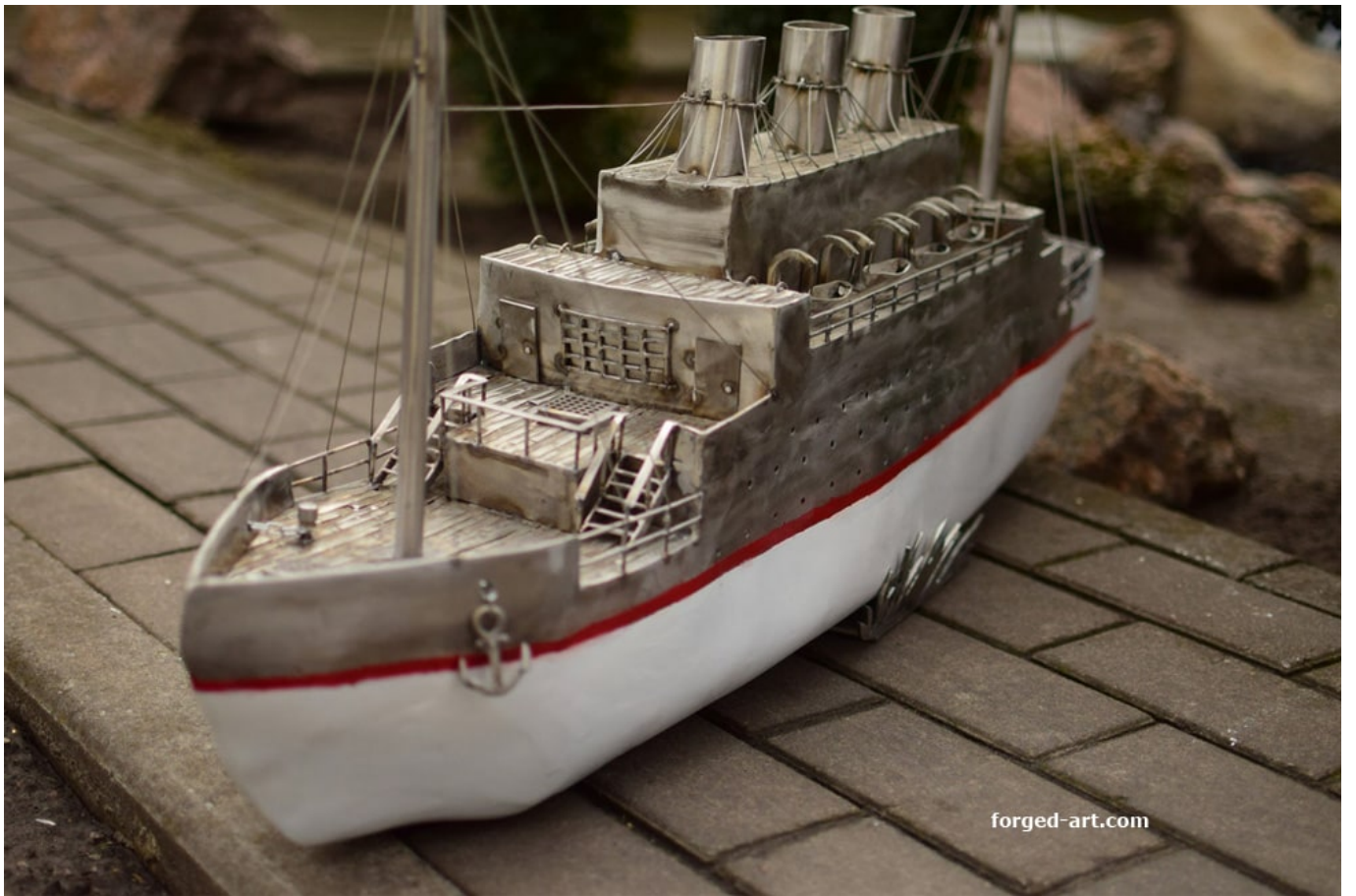
California - a handcrafted model of a steamer