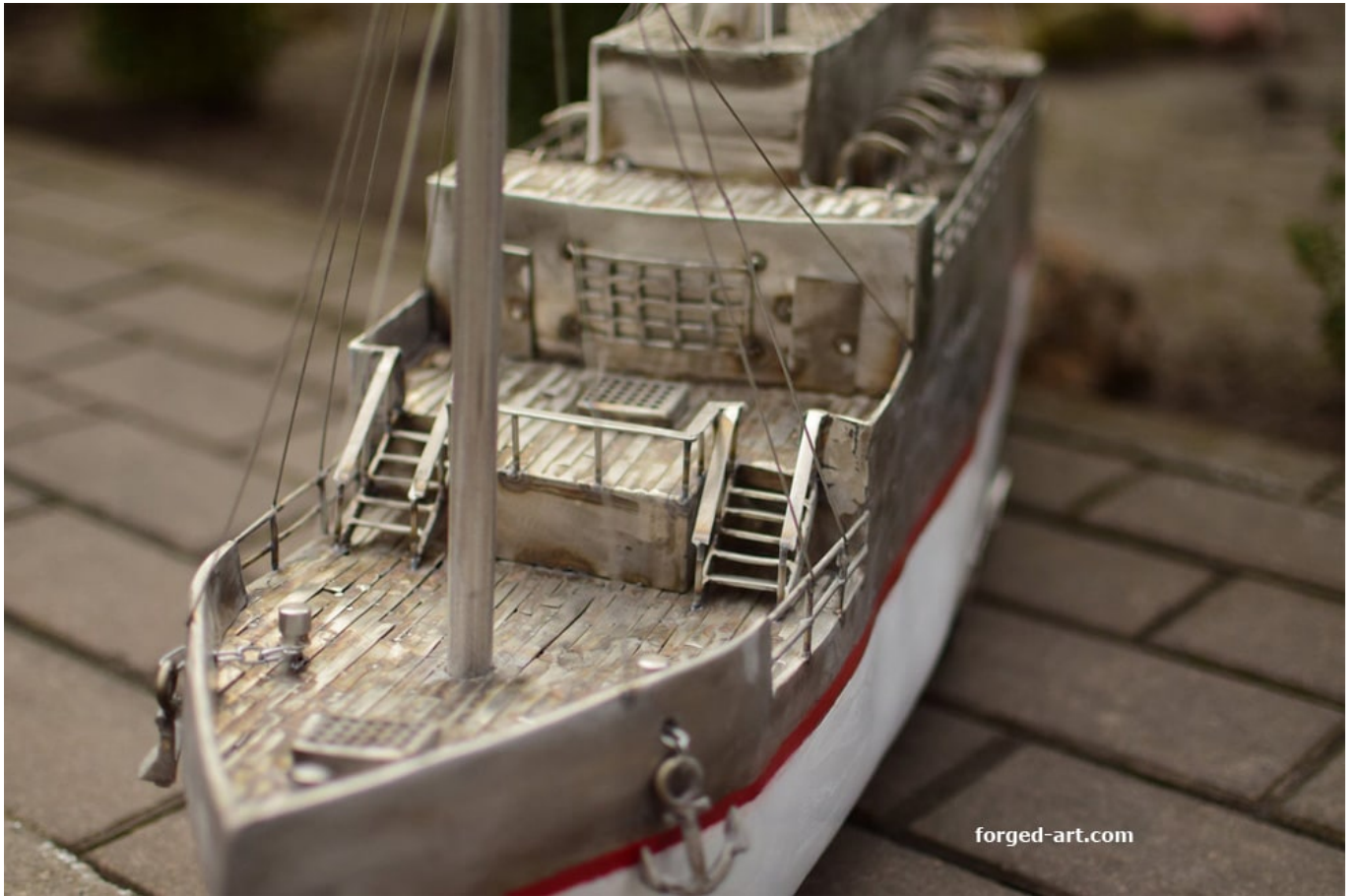
The deck of the ship is made of hundreds of hand-made elements