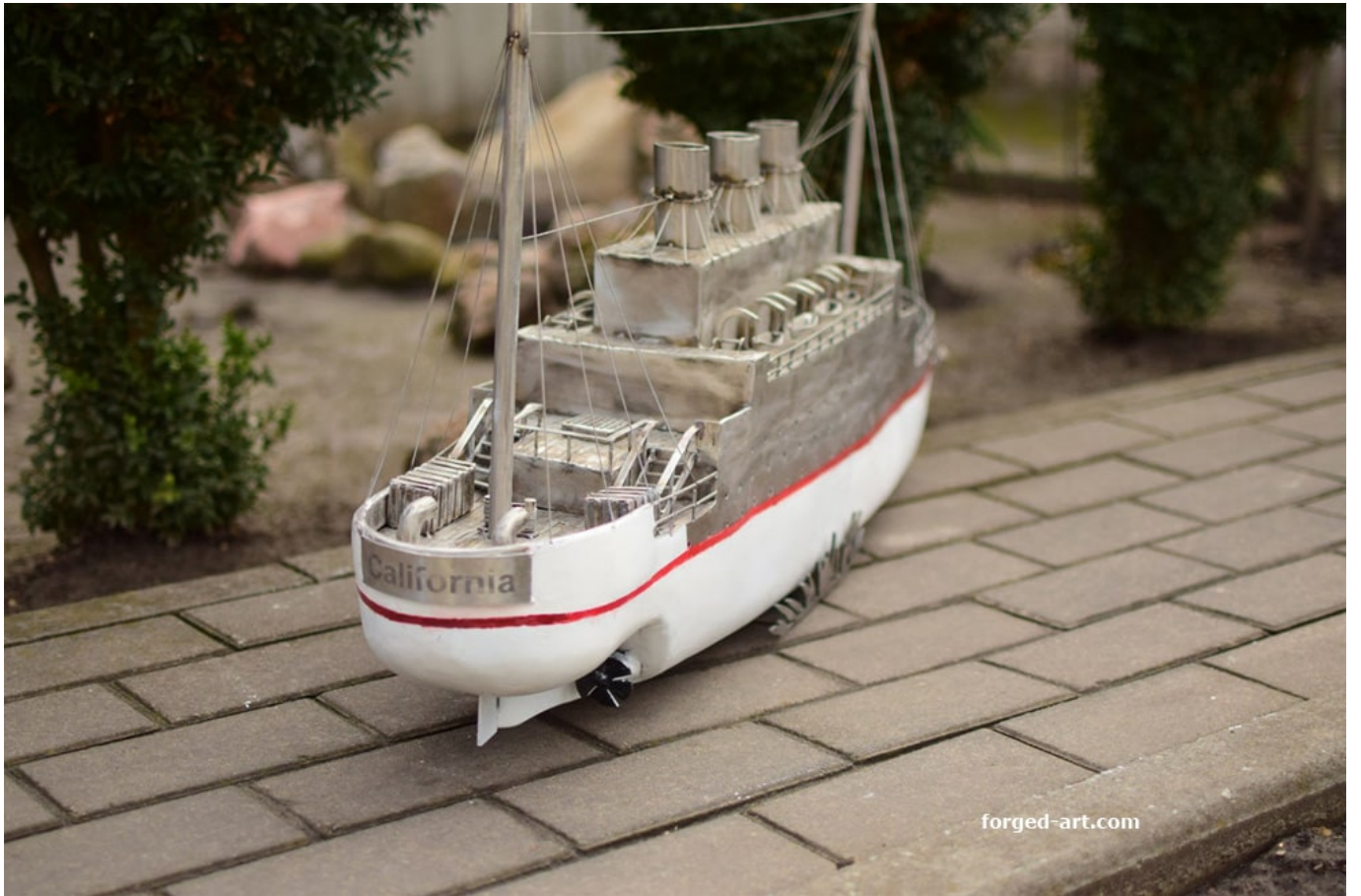
The model is made entirely of stainless steel