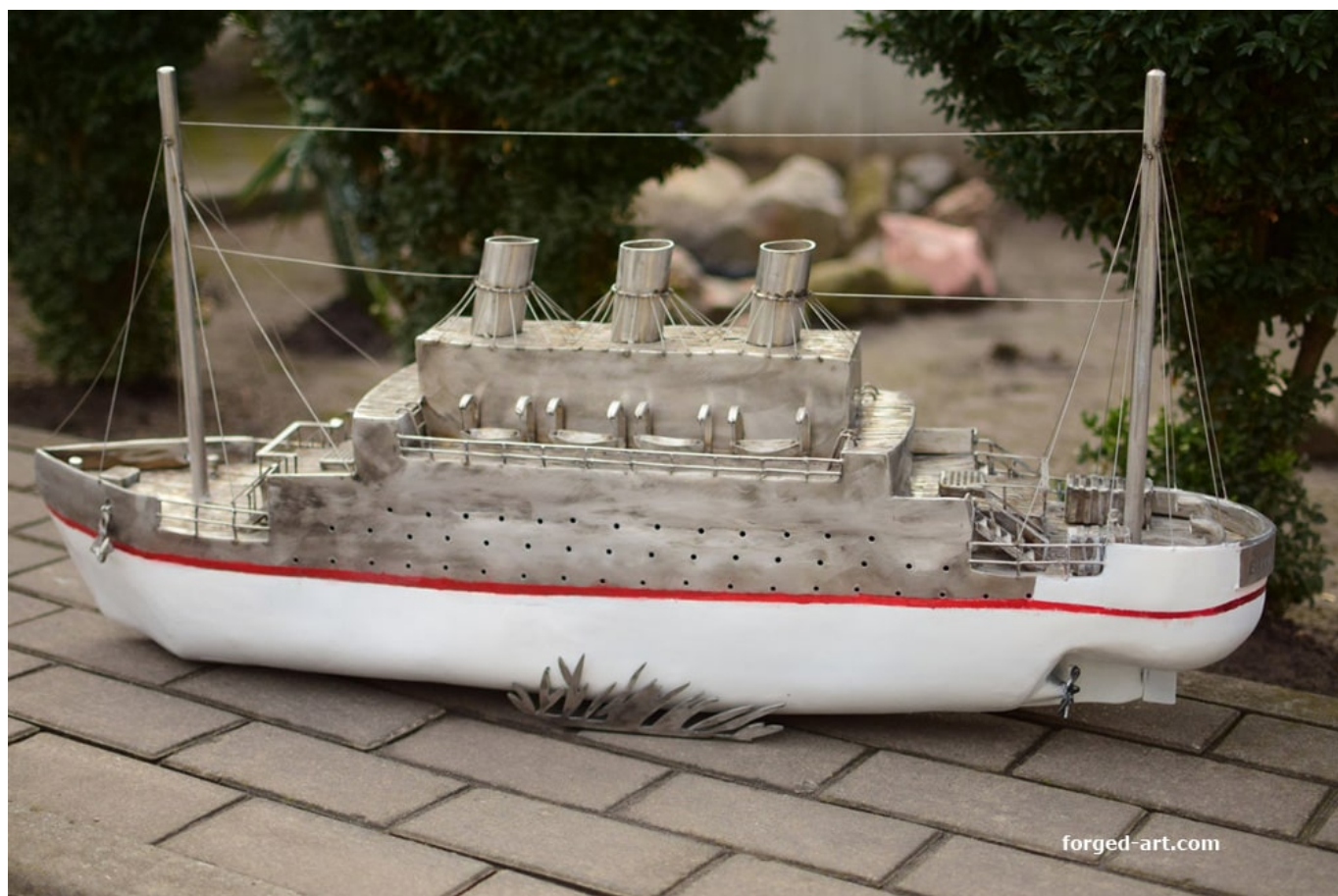
The model is very large and carefully made