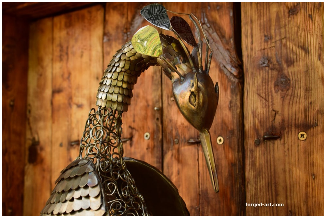
The phoenix sculpture was made by a master metalworker