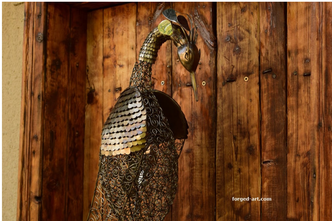
The figure is very large, has many details