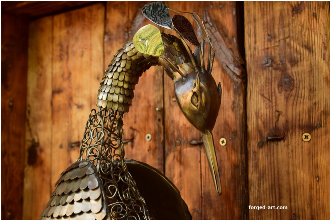
The phoenix sculpture was made by a master metalworker