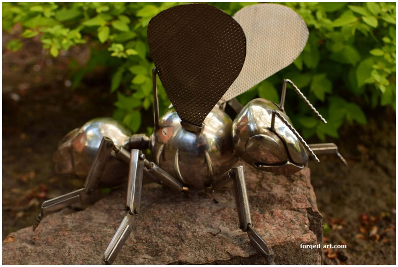
Our studio has many years of practice in the production of metal sculptures