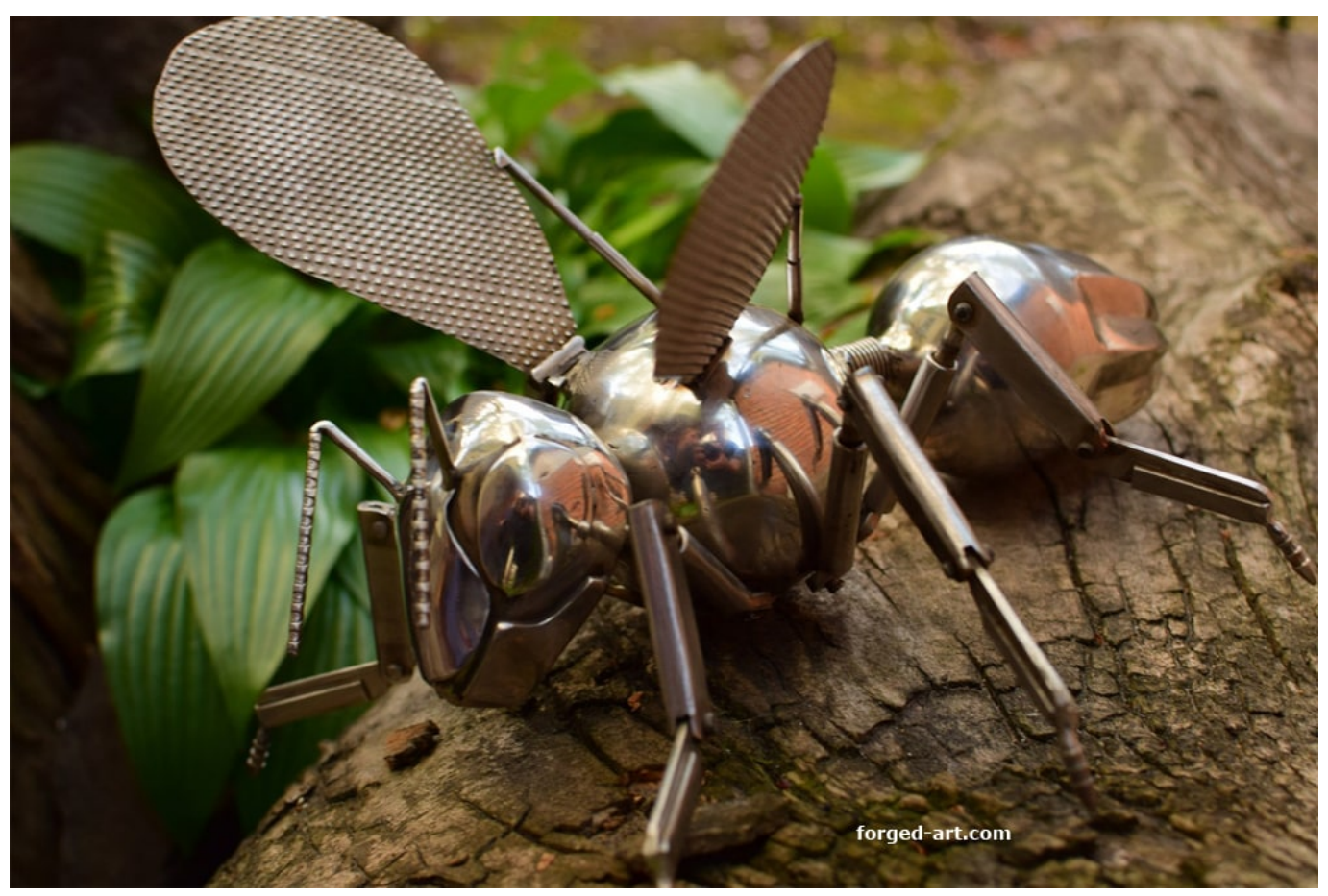
Stainless steel steampunk bee sculpture