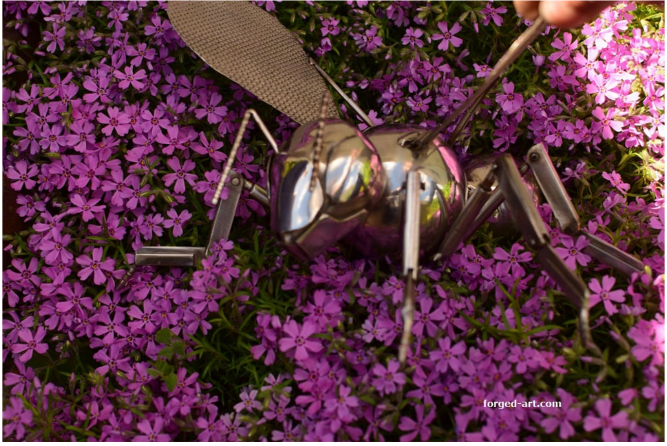
At the client's request, we make metal sculptures in any known style

Feel free to contact us, we will answer every question