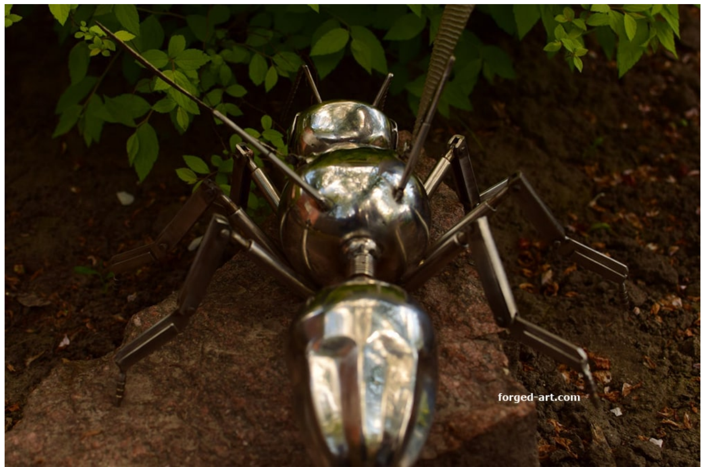
Stainless steel bee figure