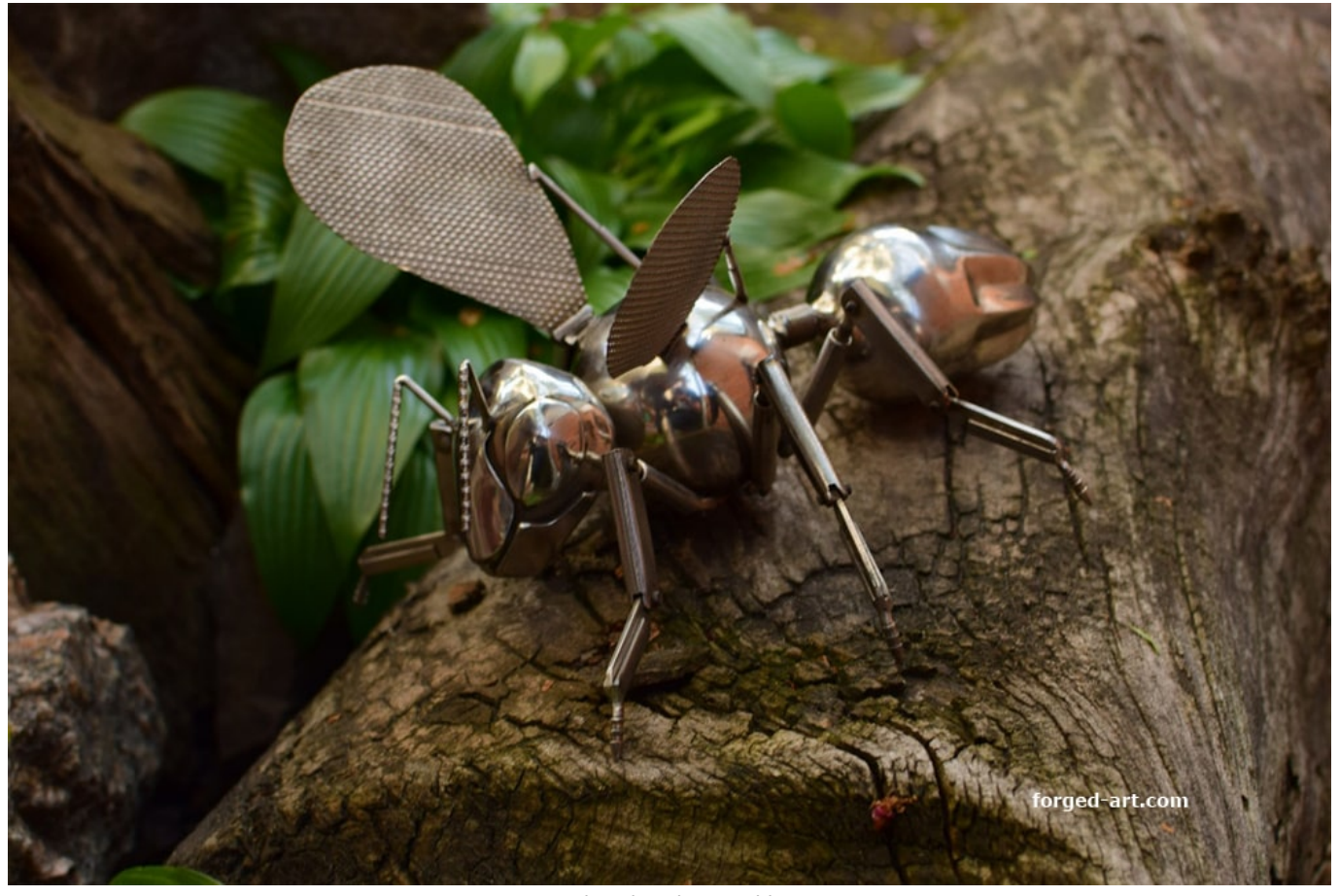
100% handmade metal bee