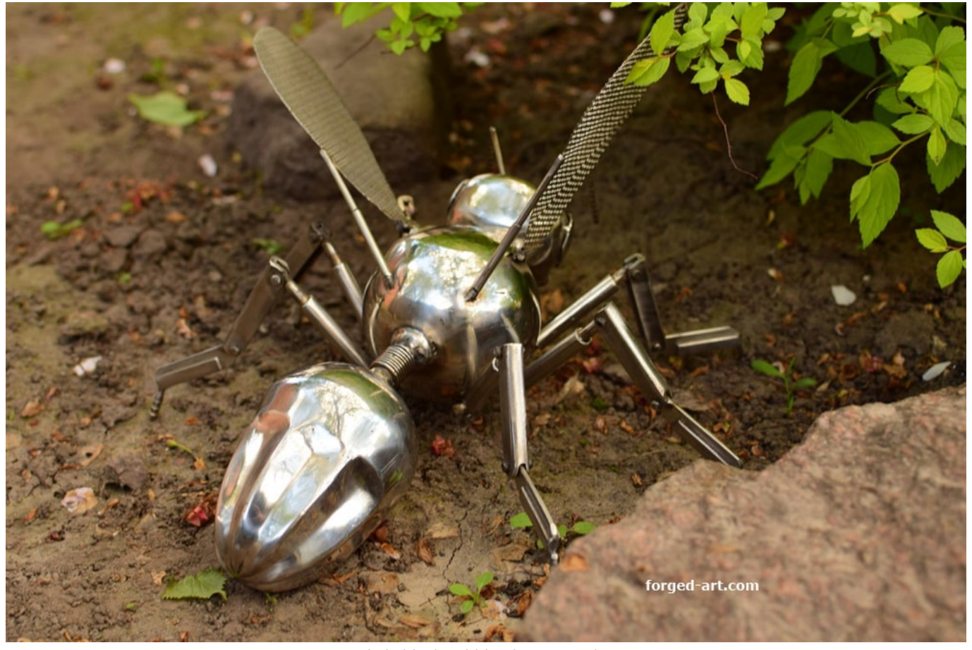
Artistic blacksmithing is our passion