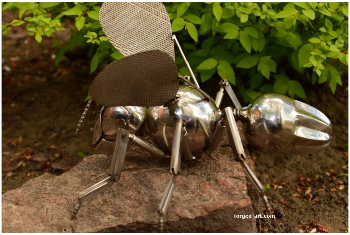
We are a manufacturer of steel sculptures