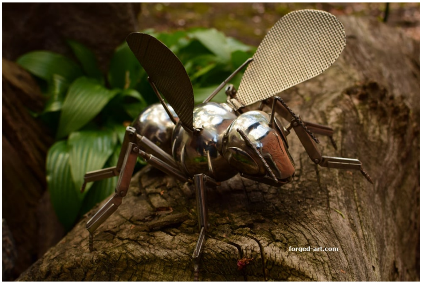
We make all our sculptures with the utmost care