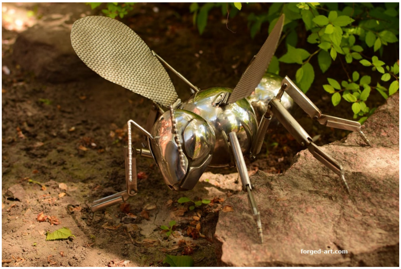
In our studio, we carry out all work in the field of blacksmithing and metalwork