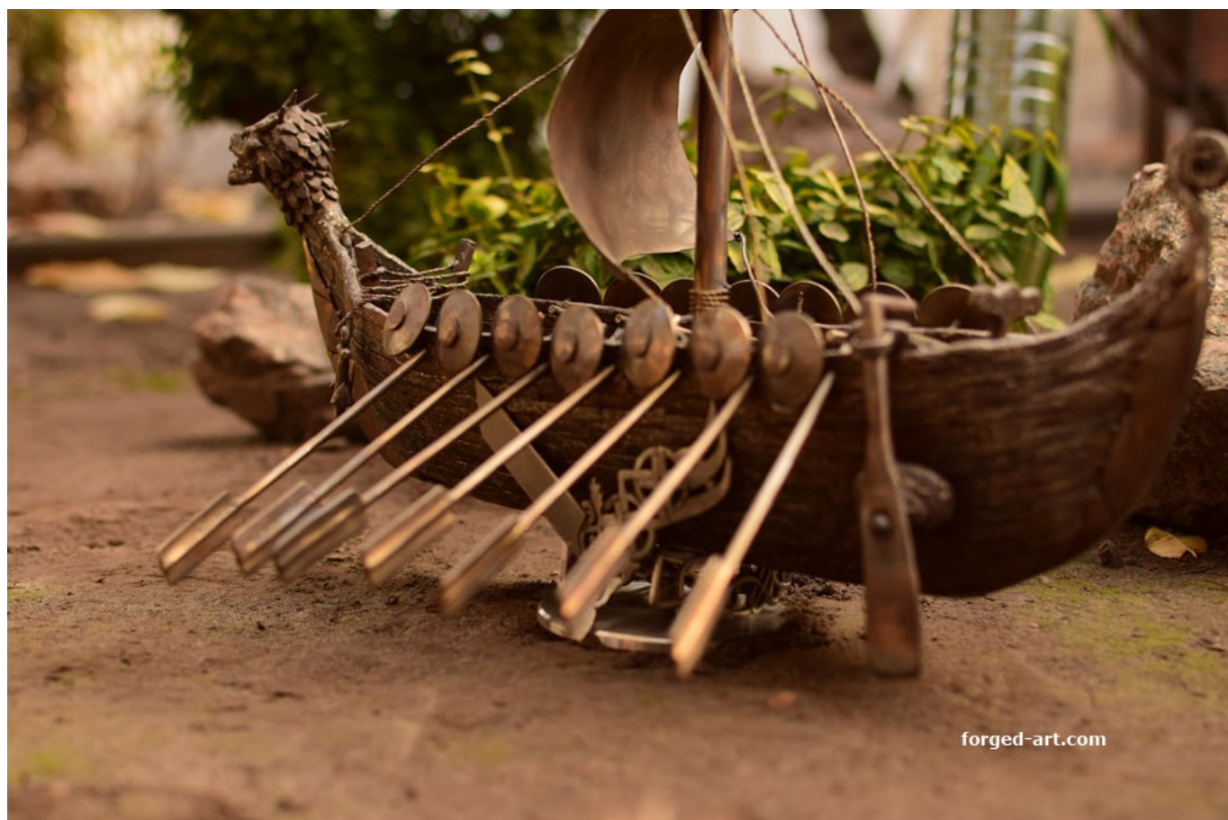
The ship is equipped with a beautiful forged base