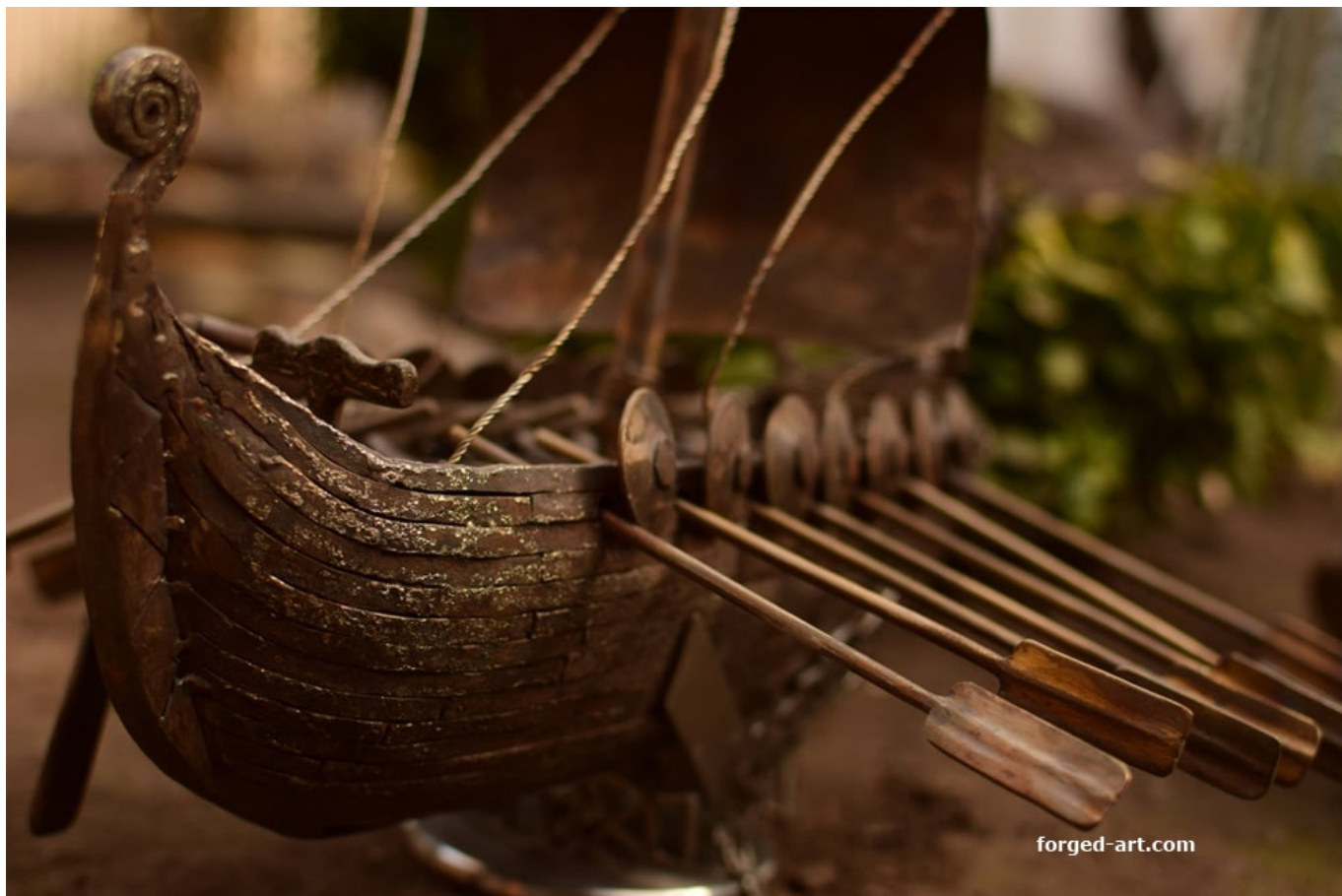
Stainless steel ships manufacturer