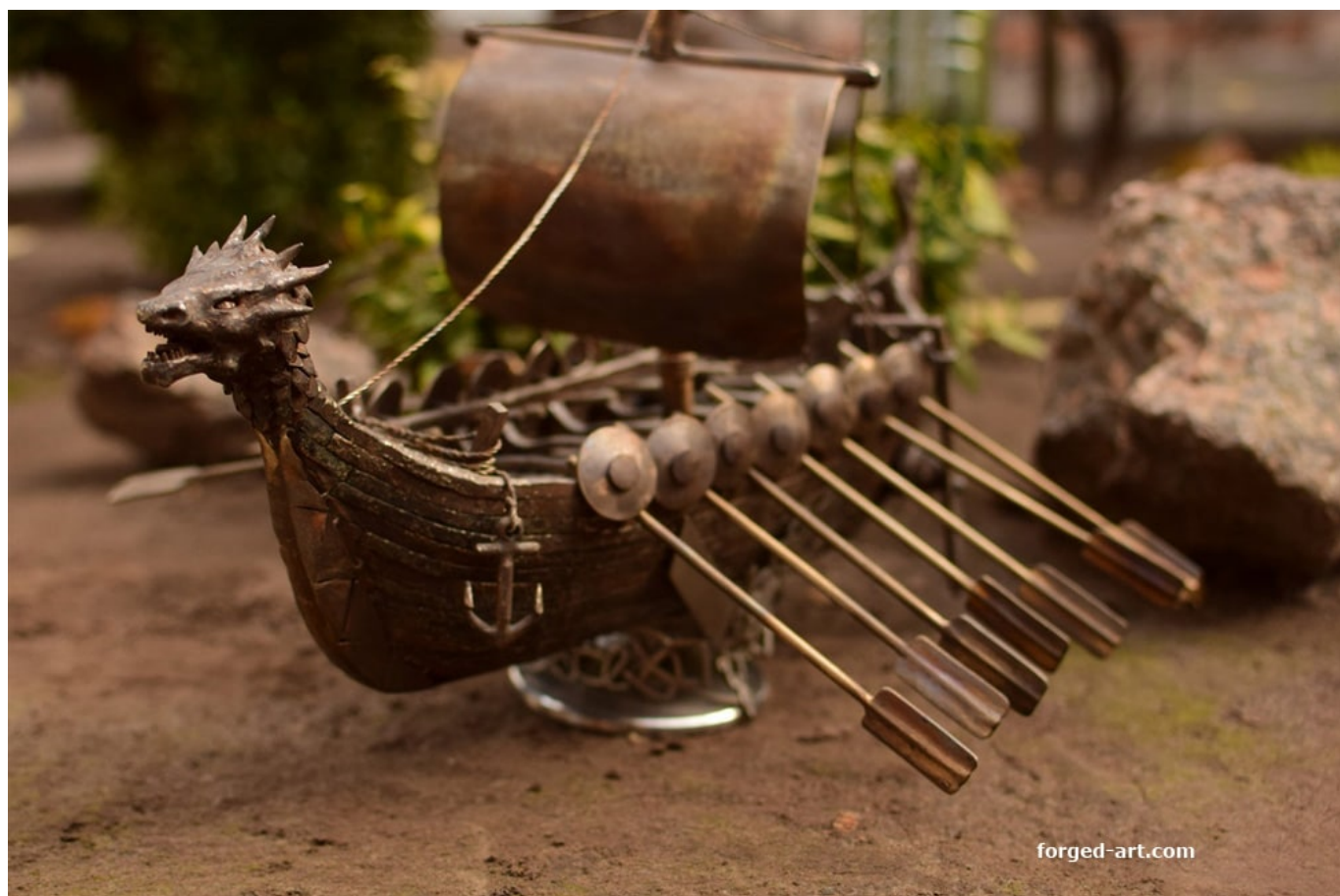
A handcrafted stainless steel viking ship