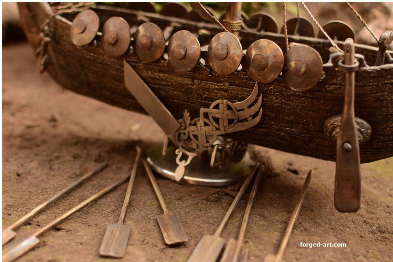
The ship's oars are demountable