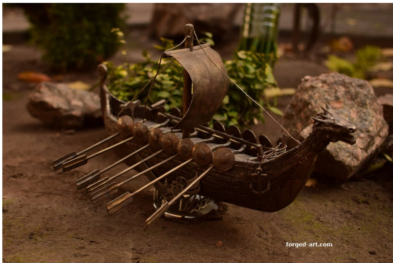
Handcrafted Viking Drakkar ship